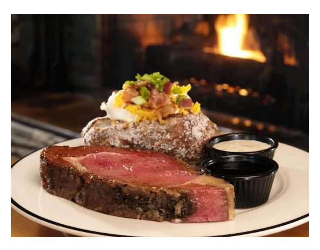
Saturday Night Chef's Plate